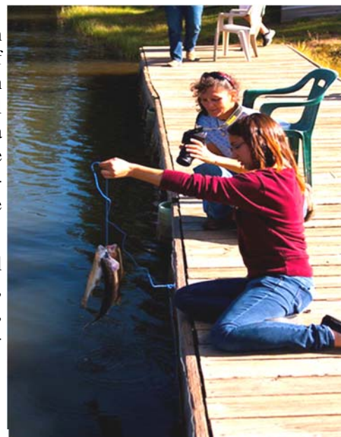
Trout for Dinner

The Post to Parks Program is an outreach initiative of Florissant Fossil Beds National Monument which aims to engage and connect veterans, active duty, and military families with our national parks through fun, healthy, and educational experiences and to foster a sense of stewardship for our public lands.