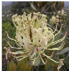
The Alamacha, Oreocallis grandiflora , produces a large and impressive flower.