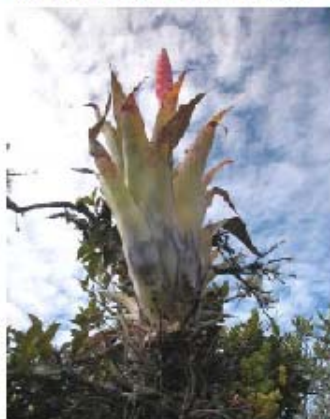
Despite the seasonally dry climate at Sexi, water contained in fog makes life for some plants possible. The leaves of Bromeliads ( Bromelia spp.) are specially adapted to funnel condensed water toward the plant.