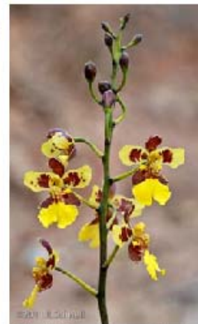
Odontoglossum angustatum is one of nine orchid species found in Sexi.