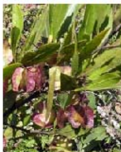
The Chamana, Dodonea viscosa , is an evergreen shrub from which the petrified forest takes its name.

The once-tropical climate at Sexi became cooler and drier with the formation of the Andes Mountains. Consequently, unlike the tropical vegetation represented in the fossil record, the modern plants in Sexi are well-suited to seasonally dry, high-elevation conditions. Many of the trees and shrubs are evergreen and have thick, hard leaves. The following images exemplify a few of the 119 plant species currently known in the district (Aragón et al., 2006).