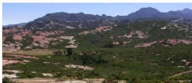
A patchwork of trees, shrubs, and herbaceous plants dot the landscape near the town.