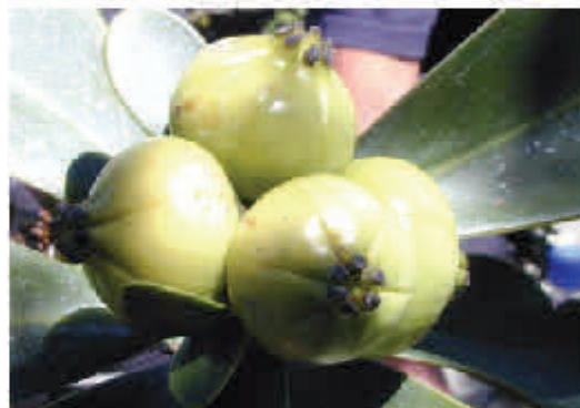
Clusia cajamarcensis is a plant species in danger of extinction. The fruit of this shrub is shown above.

The results of a preliminary inventory of the modern flora at Sexi were published in 2006. Among other conclusions, Aragón et al. (2006) found that "urgent measures" were necessary to protect the modern flora of Sexi, which the local people depend upon for its useful plants, pastorage for animals, and firewood. Conservation efforts, such as reforestation, should help maintain the modern forest's biodiversity while remaining sensitive to the lifestyles of the citizens of Sexi.