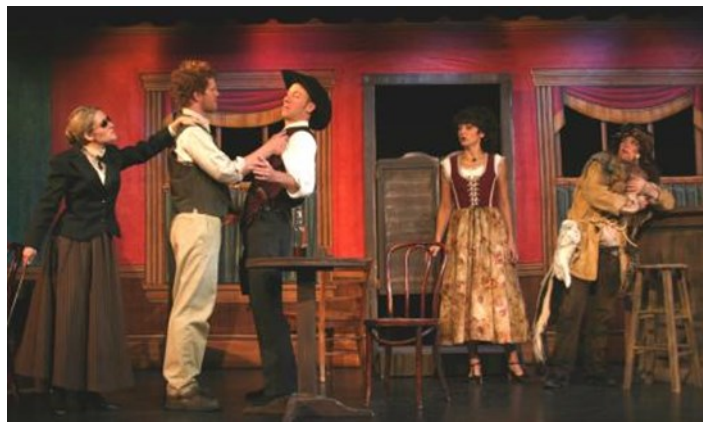
Take in a Melodrama at The Butte Theater

Since the town's early days, theater has always been a part of the rich heritage of Cripple Creek. The "Butte Concert and Beer Hall" premiered in 1896. Cripple Creek's opera house went on to have many lives over its 100+ year history – it was a skating rink, a dance academy, and an auto garage, to name a few. It even housed the Cripple Creek Fire Department