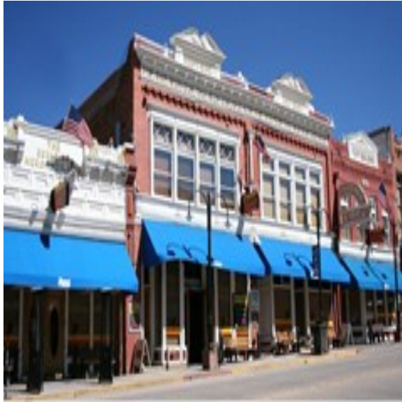
Stay at Bronco Billy's Hotel