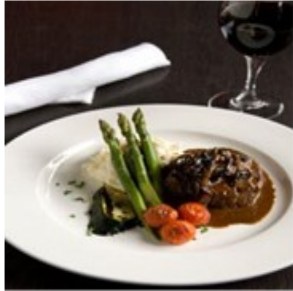
Dine at the Steakhouse