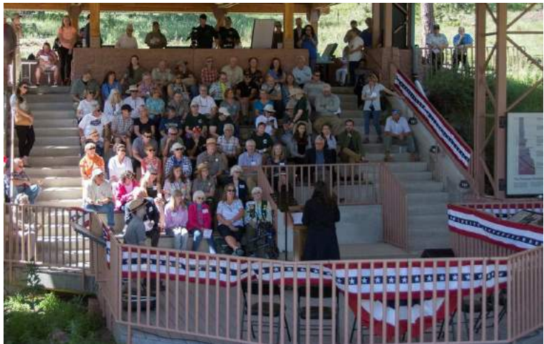
The crowd for the daytime gathering of the 50th Celebration

The latter half of the program entailed three panel presentations by People Who Lived on the Land, People Who Fought for the Monument and People Who Worked Here.