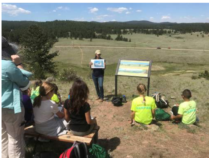
A group of students enjoying a presentation during camp